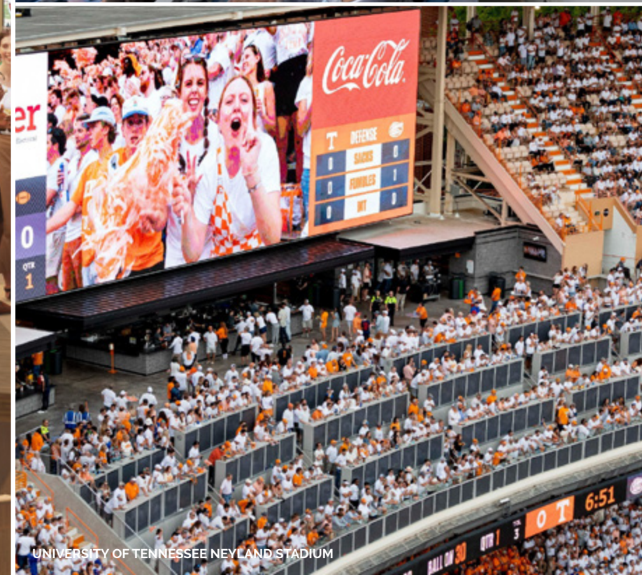
UNIVERSITY OF TENNESSEE NEYLAND STADIUM