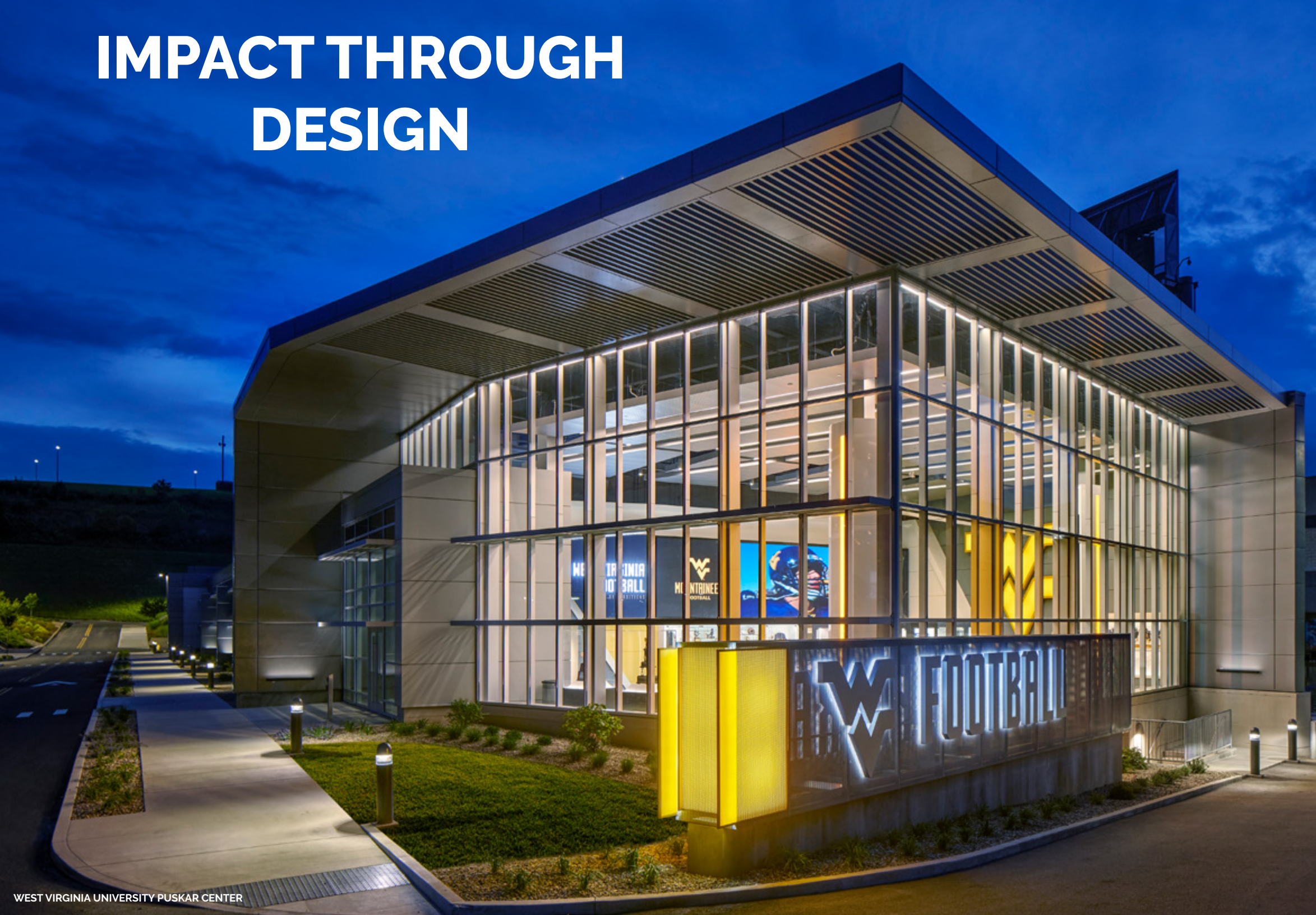
WEST VIRGINIA UNIVERSITY PUSKAR CENTER