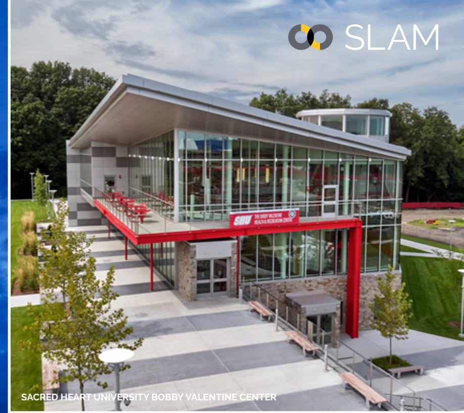
SACRED HEART UNIVERSITY BOBBY VALENTINE CENTER