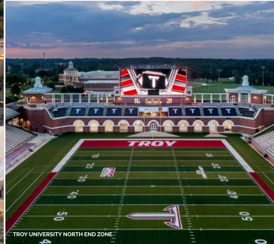
TROY UNIVERSITY NORTH END ZONE