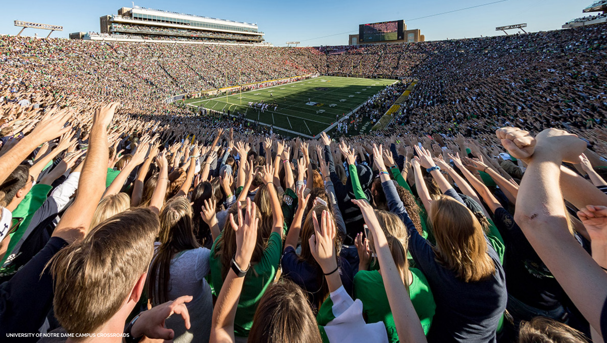
UNIVERSITY OF NOTRE DAME CAMPUS CROSSROADS