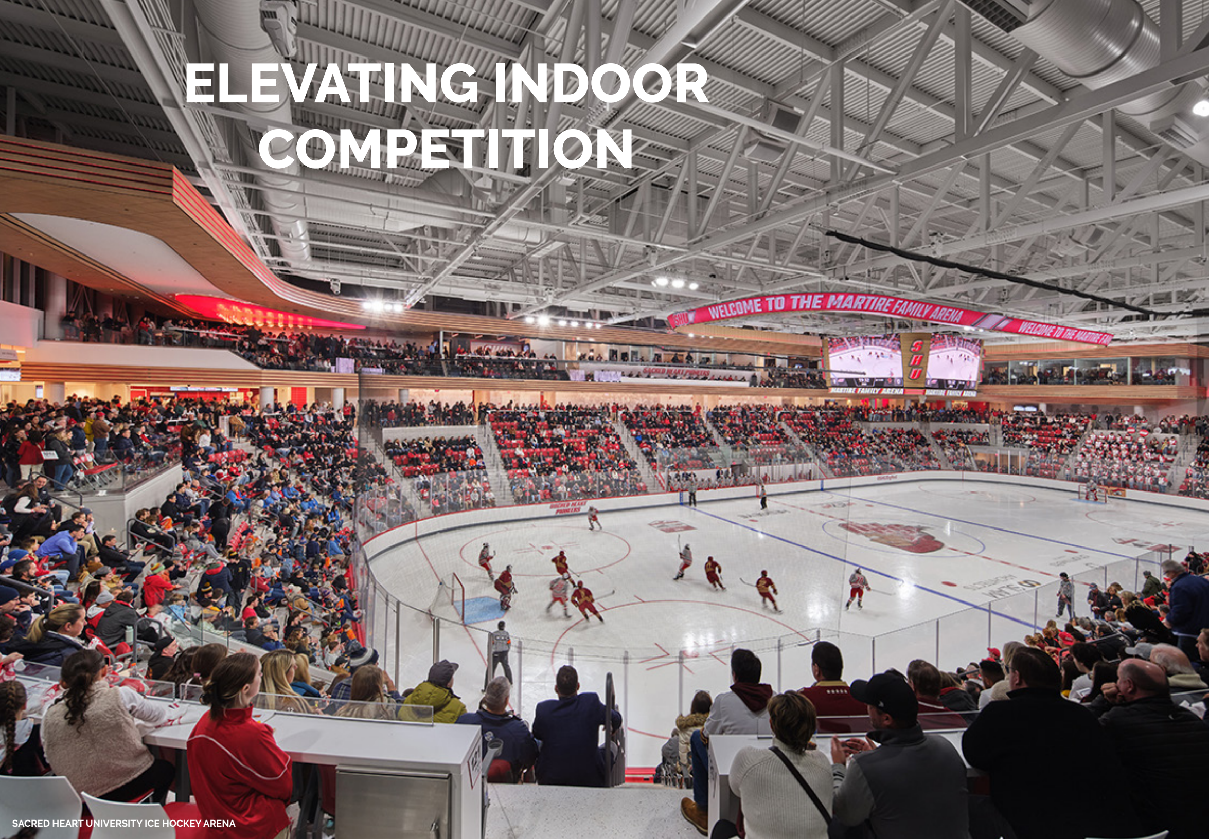
SACRED HEART UNIVERSITY ICE HOCKEY ARENA