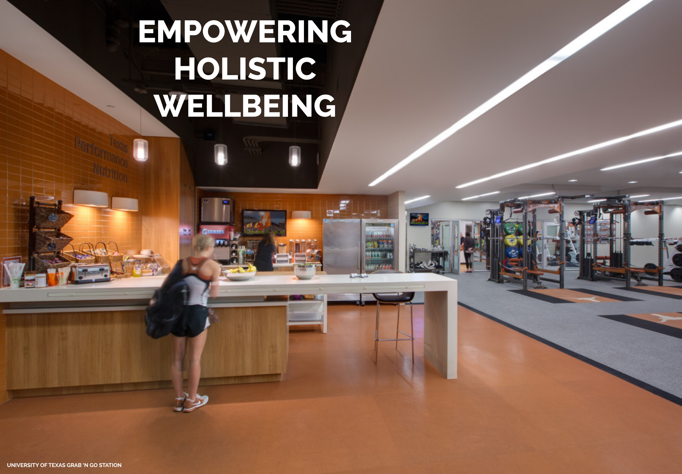
UNIVERSITY OF TEXAS GRAB 'N GO STATION