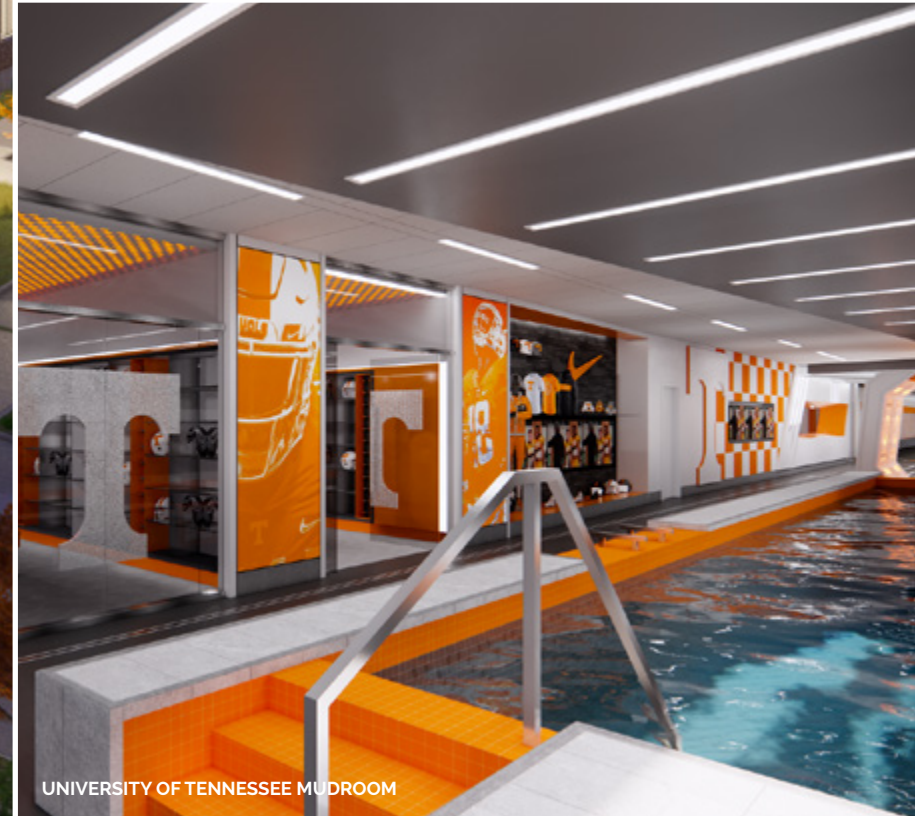
UNIVERSITY OF TENNESSEE MUDROOM