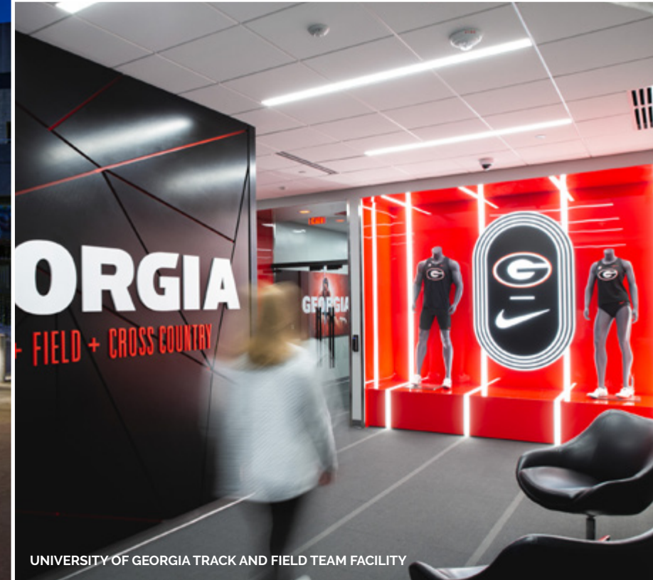
UNIVERSITY OF GEORGIA TRACK AND FIELD TEAM FACILITY