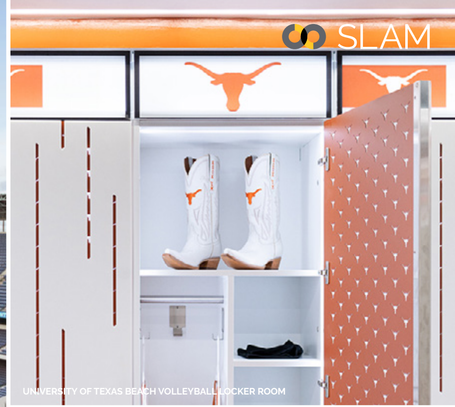
UNIVERSITY OF TEXAS BEACH VOLLEYBALL LOCKER ROOM