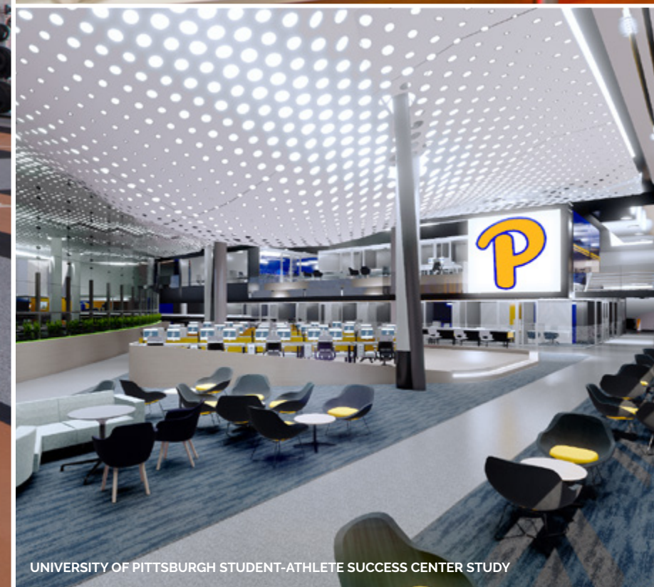
UNIVERSITY OF PITTSBURGH STUDENT-ATHLETE SUCCESS CENTER STUDY