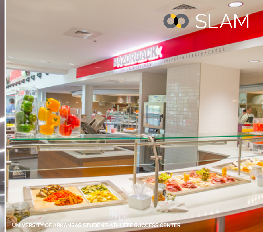
UNIVERSITY OF ARKANSAS STUDENT-ATHLETE SUCCESS CENTER