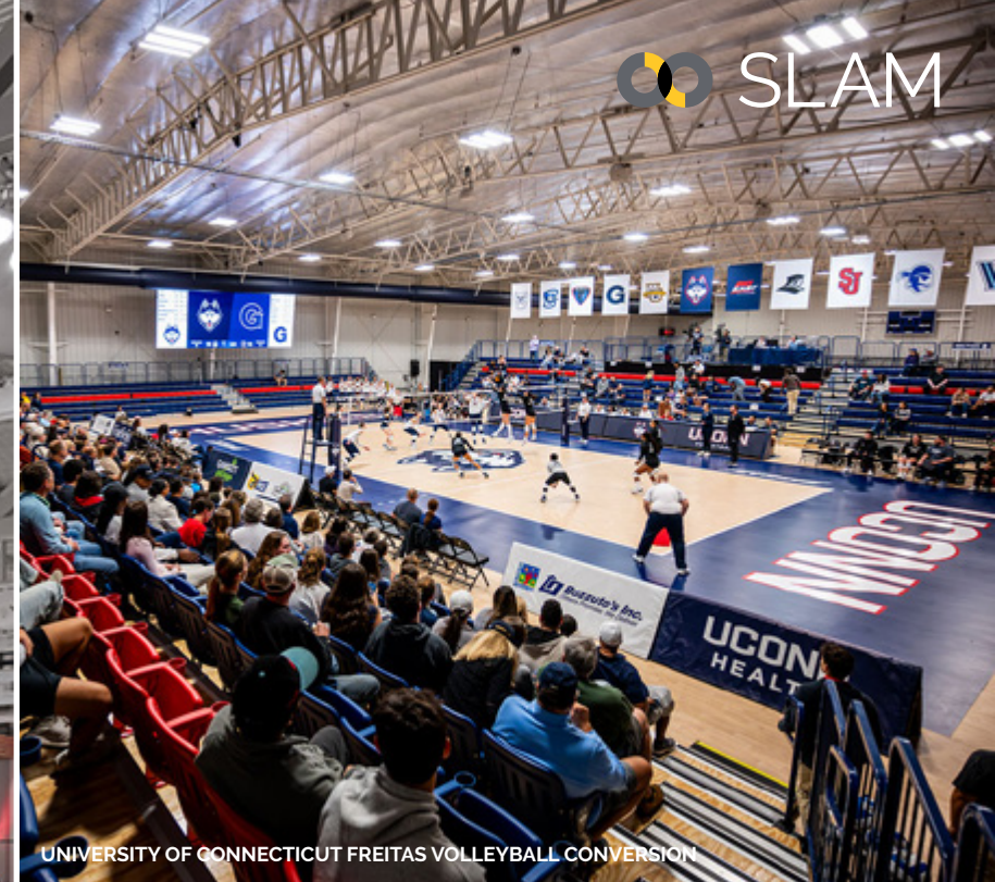
UNIVERSITY OF CONNECTICUT FREITAS VOLLEYBALL CONVERSION