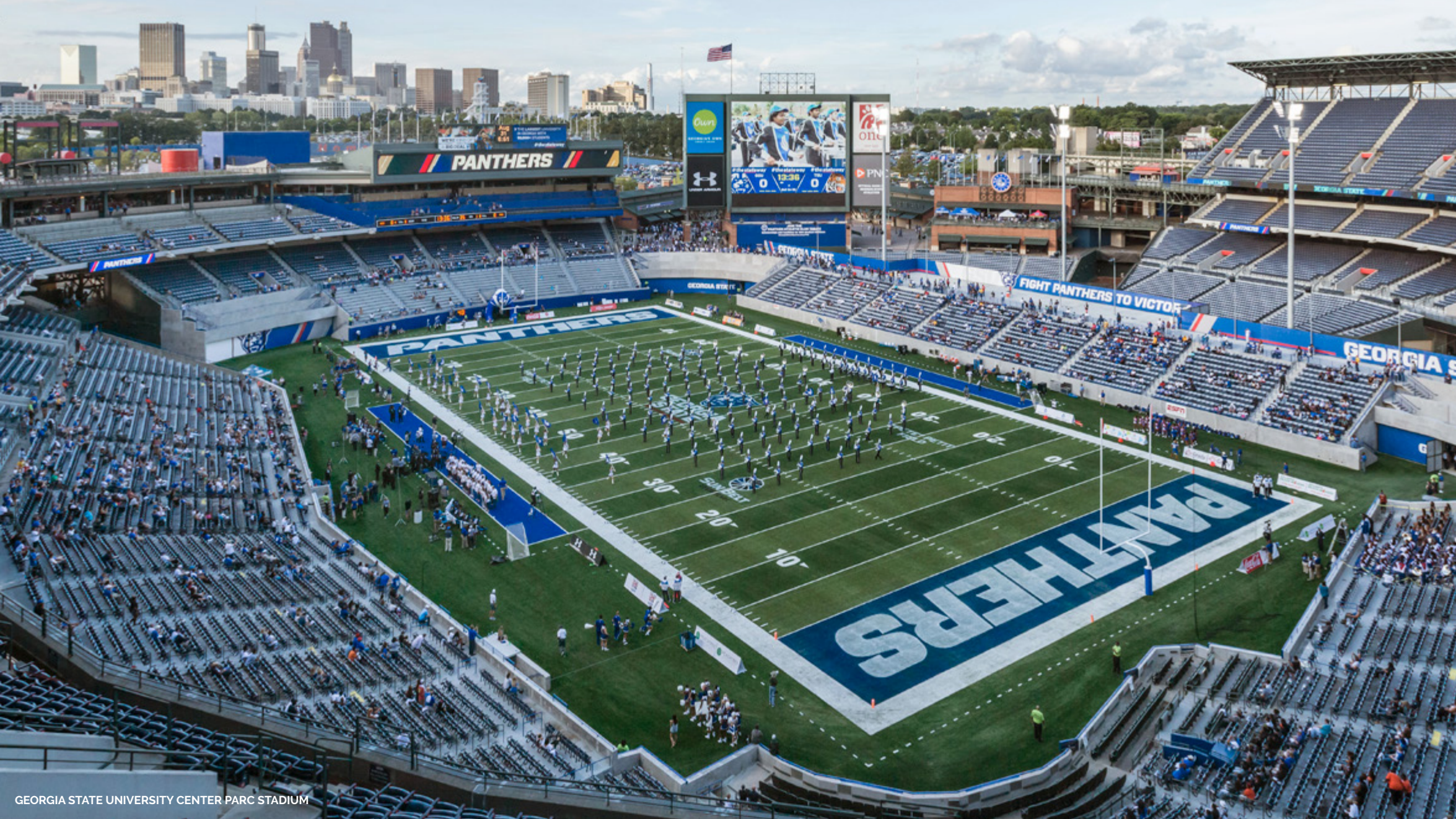
GEORGIA STATE UNIVERSITY CENTER PARC STADIUM