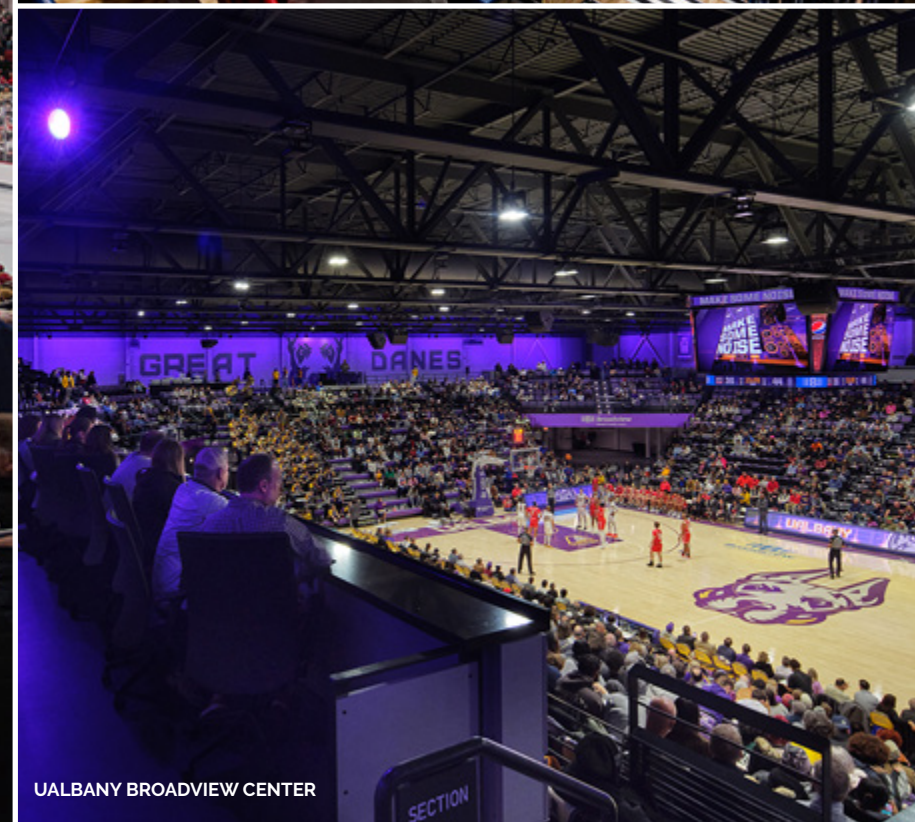
UALBANY BROADVIEW CENTER