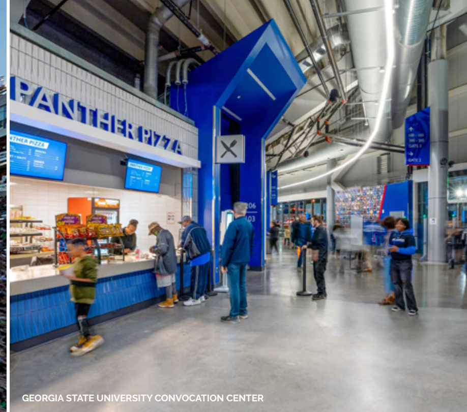
GEORGIA STATE UNIVERSITY CONVOCATION CENTER