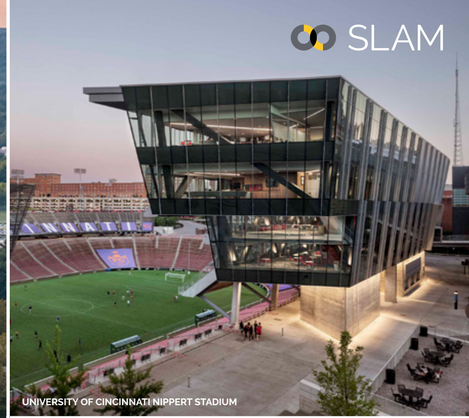
UNIVERSITY OF CINCINNATI NIPPERT STADIUM