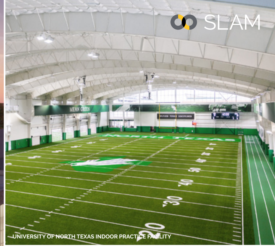
UNIVERSITY OF NORTH TEXAS INDOOR PRACTICE FACILITY