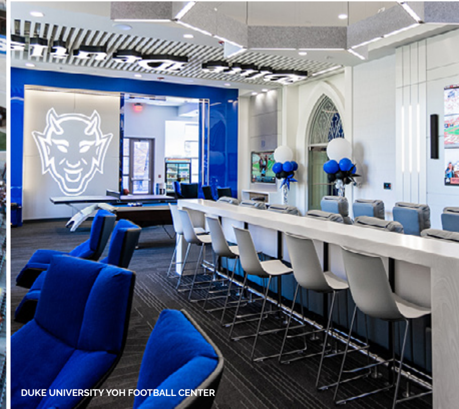
DUKE UNIVERSITY YOH FOOTBALL CENTER