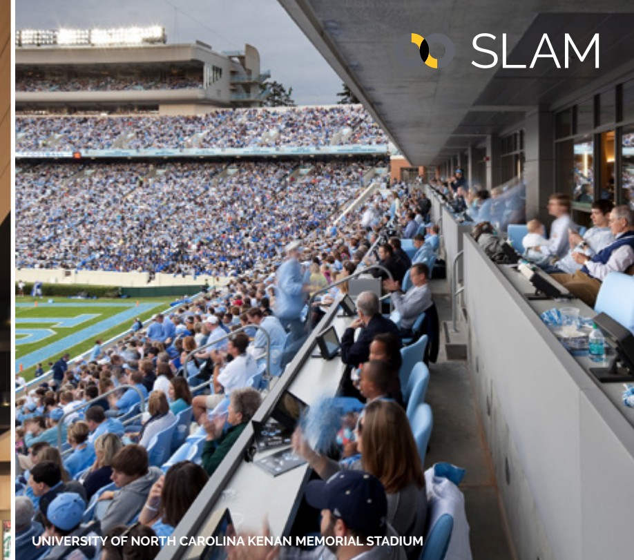
UNIVERSITY OF NORTH CAROLINA KENAN MEMORIAL STADIUM